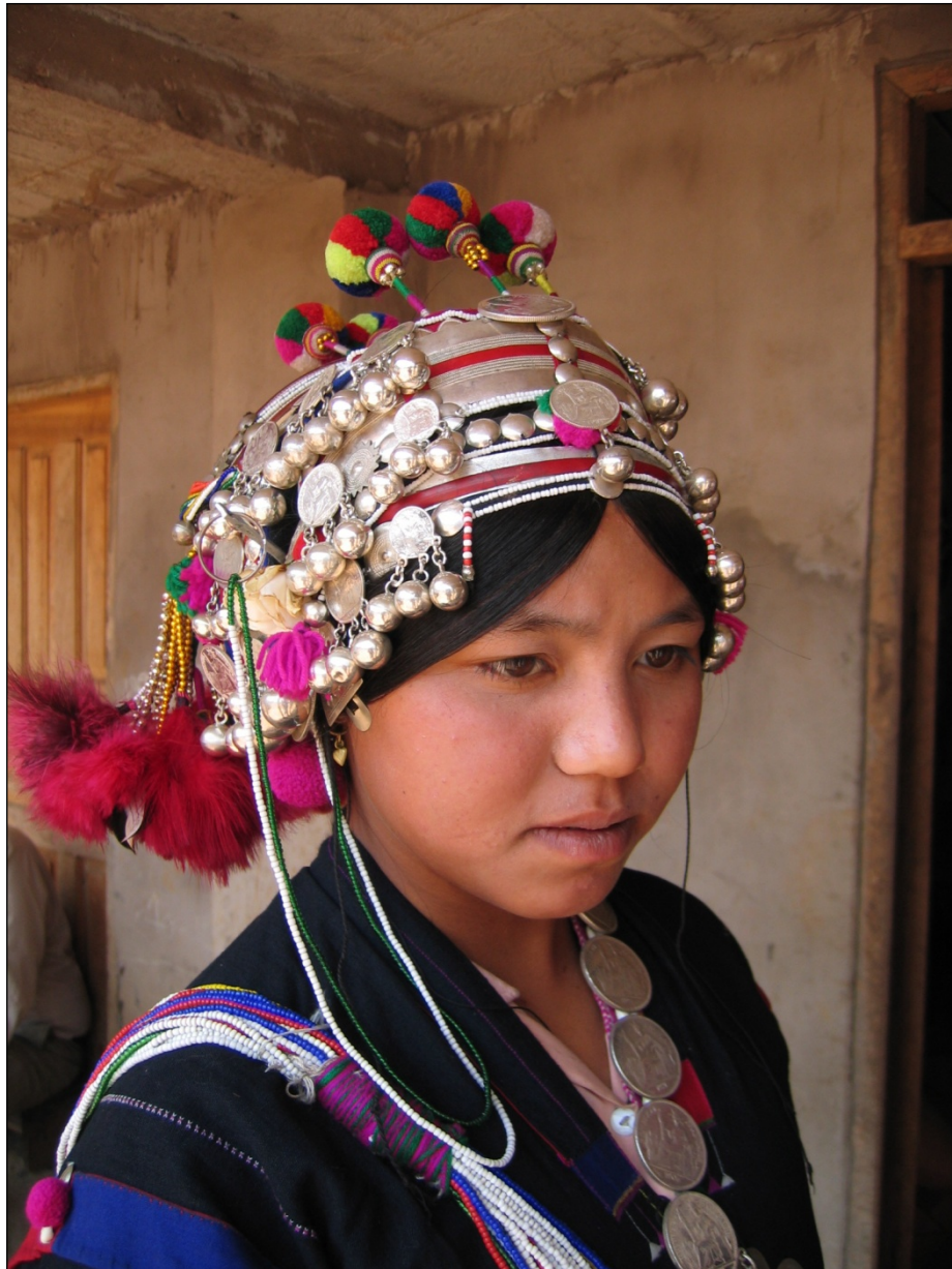
Akha Girl in Meuang Long (Tibeto-Burman)