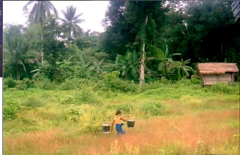
Above: O Yoe girls in Phongsaly pounding rice Below: Lao girl fetching water in Soulhouma, Champasak