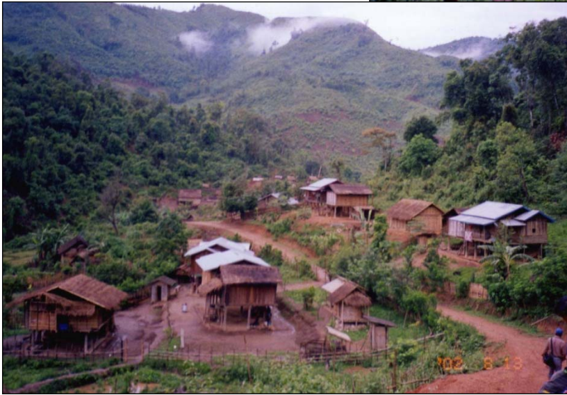
Relocated Khmou village in Viengxay District, Houa Phan where paddy land is not sufficient