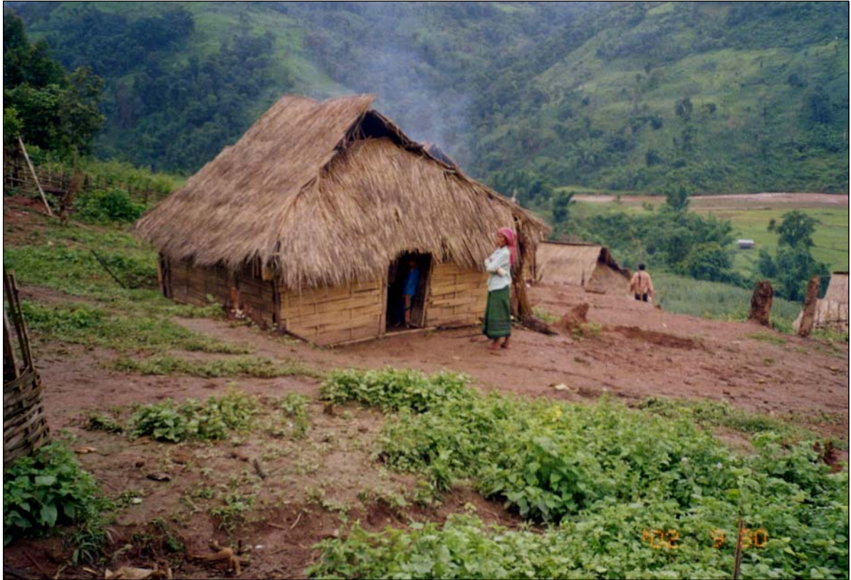
Newly relocated O Yoe Village in Nyot Ou, Phongsaly