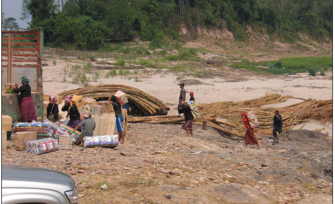
Unsustainably harvested rattan waiting for shipment to China from Louang Namtha

With respect to electrification, out of 95 villages only two that happened to be near transmission lines were electrified (not including mini-hydro). Villages in Sangthong District of Vientiane Municipality are using solar panels.