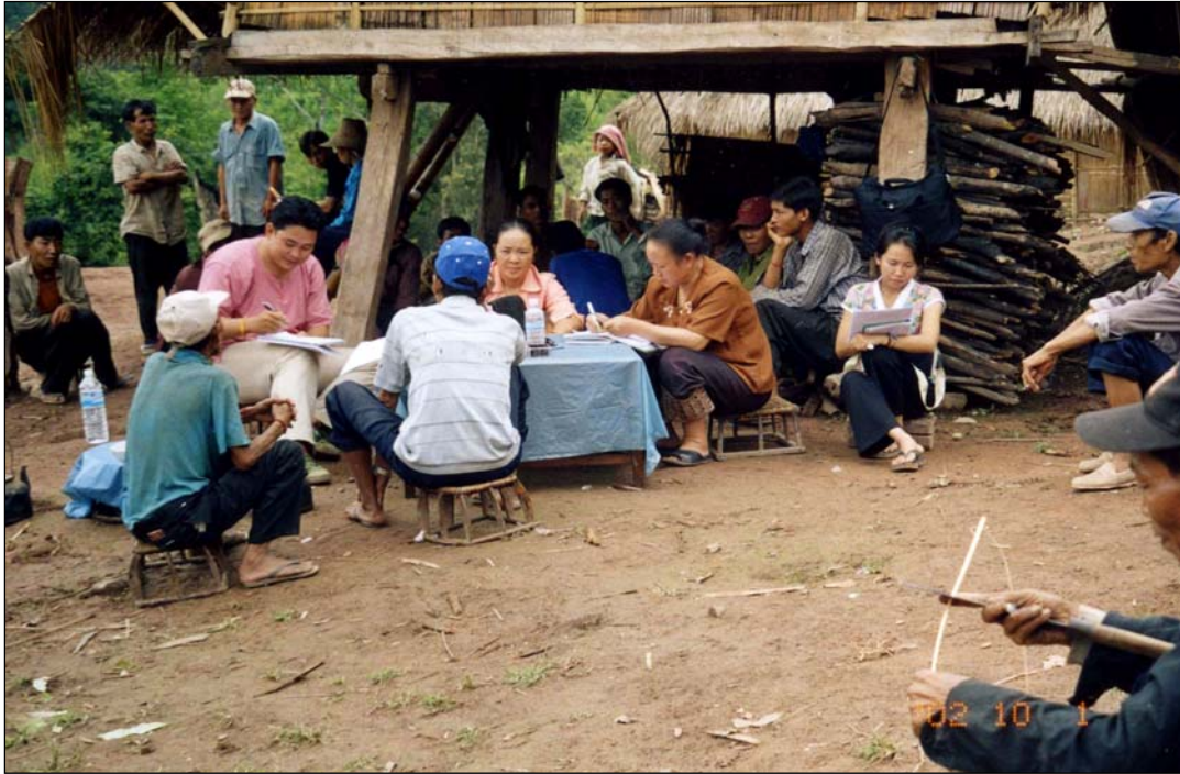
Data Collection in Ban Chom Pho, Phongsaly