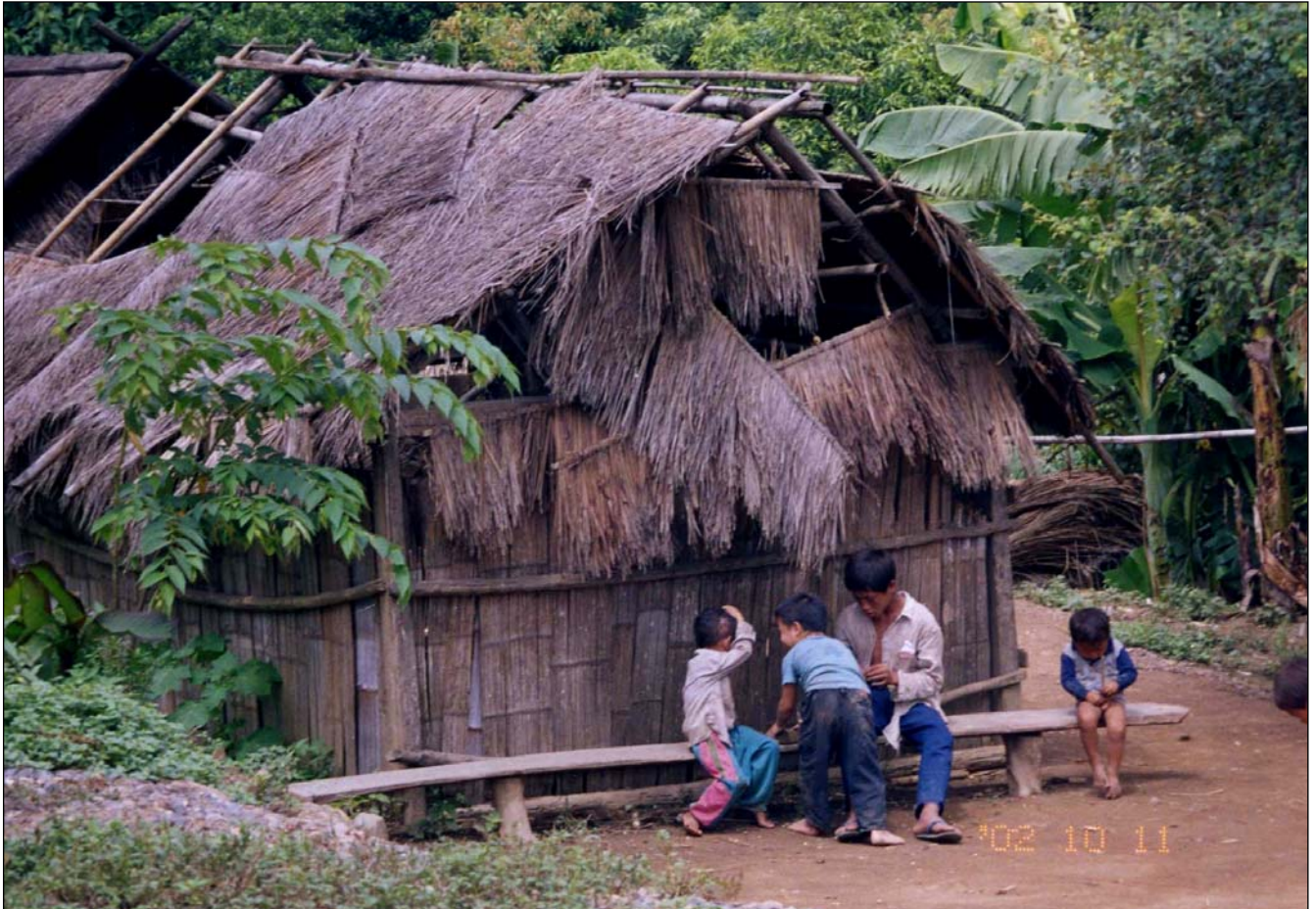
Hmong children playing in an abandoned house at Ban Phon Si, Meuang Beng

versus 25 percent of the Lao-Tai lives in the government's priority poor districts. Furthermore, 24 percent of the country's population lives in first priority districts of which 57 percent are non-Lao-Tai or, stated another way, 41 percent of all non-Lao-Tai people live in first priority districts compared to only 16 percent of the total Lao-Tai group. Non priority areas contain 74 percent of the Lao-Tai population (50 percent of the country's total), compared to only 45 percent of the non-Lao-Tai (or 15 percent of the population). 8