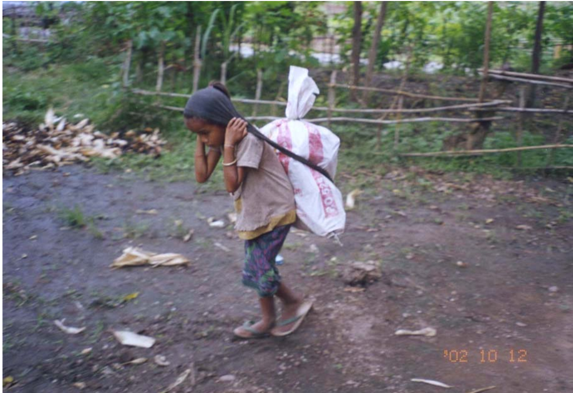
Young Khmou girl in the North taking corn to the market