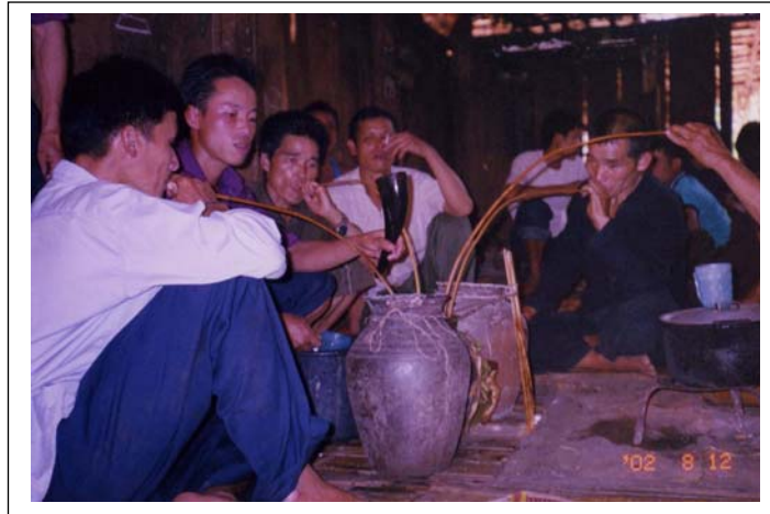
Drinking Rice Wine at a Ceremony in Dak Cheung, Southern Laos

production. Social structures militate against overproduction and so the premise that productivity may be readily increased, either by outside programs or by market forces, must be viewed with caution. Before making such causal assumptions, it is necessary to provide through critical observation some measurement of the impact of actual social systems upon domestic production, and this has not been done.