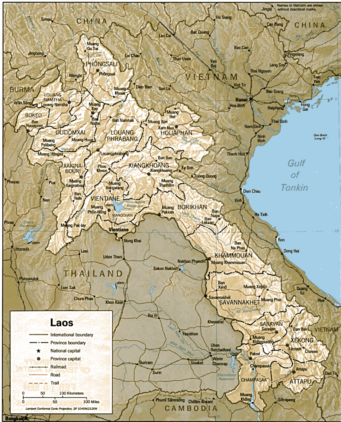
Figure 1 - Map of the Lao PDR