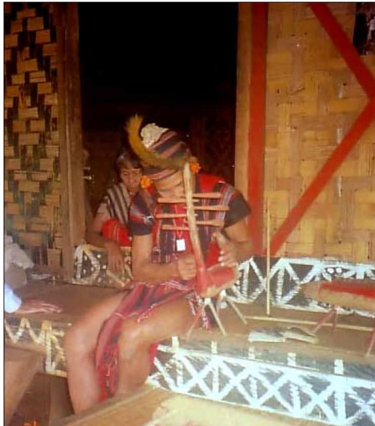
Jru Man in Champasak (Mon-Khmer)

The ethnic groups of Laos are classified ethnolinguistically into four families: