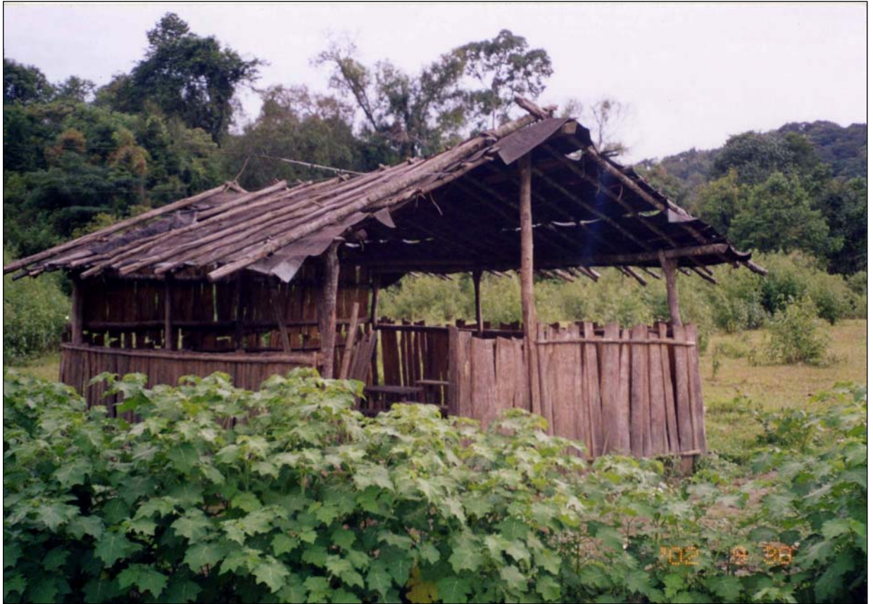
School in Ban Souan Teng, Nyot Ou