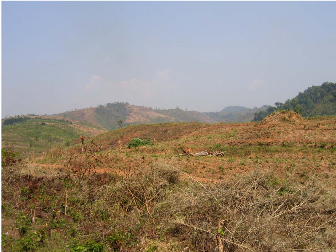
Land deforested for rubber planting in Louang Namtha