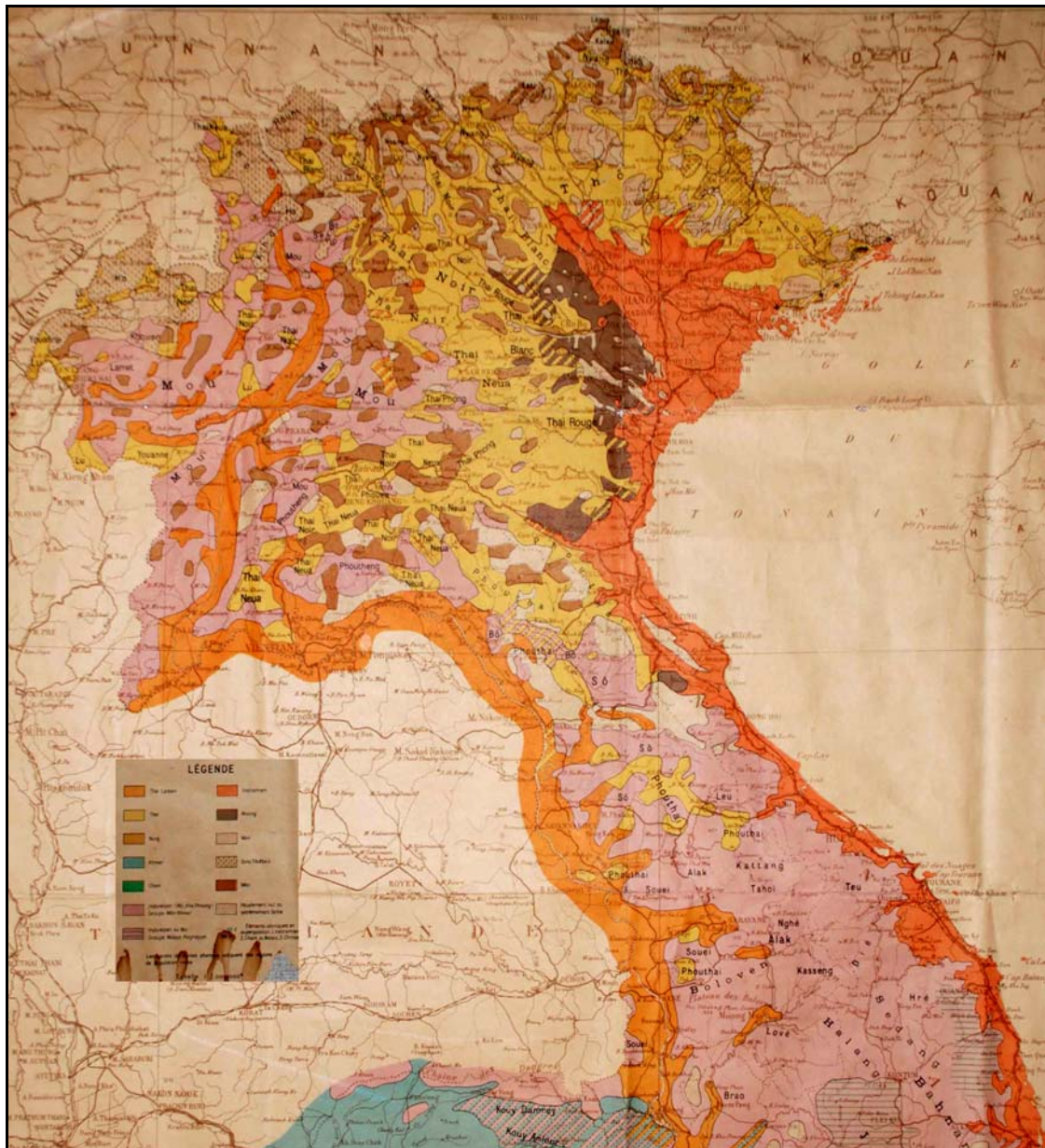
Figure 2 - Carte Ethnolinguistique (Carte de l'Indochine)