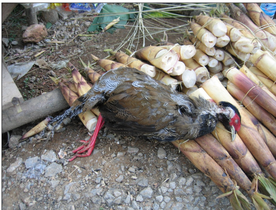
Rare pheasant for sale along the Northern Economic Corridor

Villagers express appreciation for the roads as it makes walking easier and allows them to visit relatives in neighboring villages more frequently.