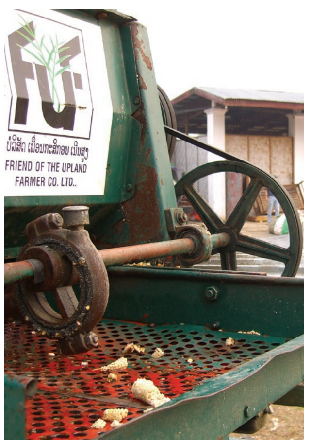
FUF has built large processing facilities for adding value to crops grown under contract with farmers in upland villages of Luang Nam Tha

Contracts are also a burden to FUF because by adding on services like extension they detract from its core mission of marketing. "We want to spend less time in the villages everyday, we lose money on extension, it's time consuming