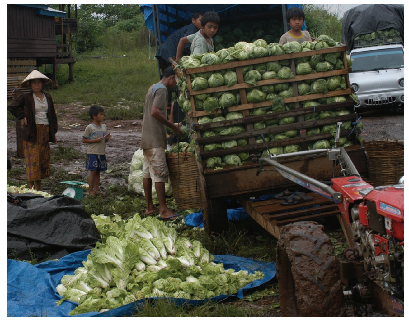
Farmers loads cabbages as rain falls on the rich soils of the Bolaven plateau in Champasak

Filling the gap between trust and enforcement could raise confidence on both sides leading to more orders, more dependable supply, and higher incomes.