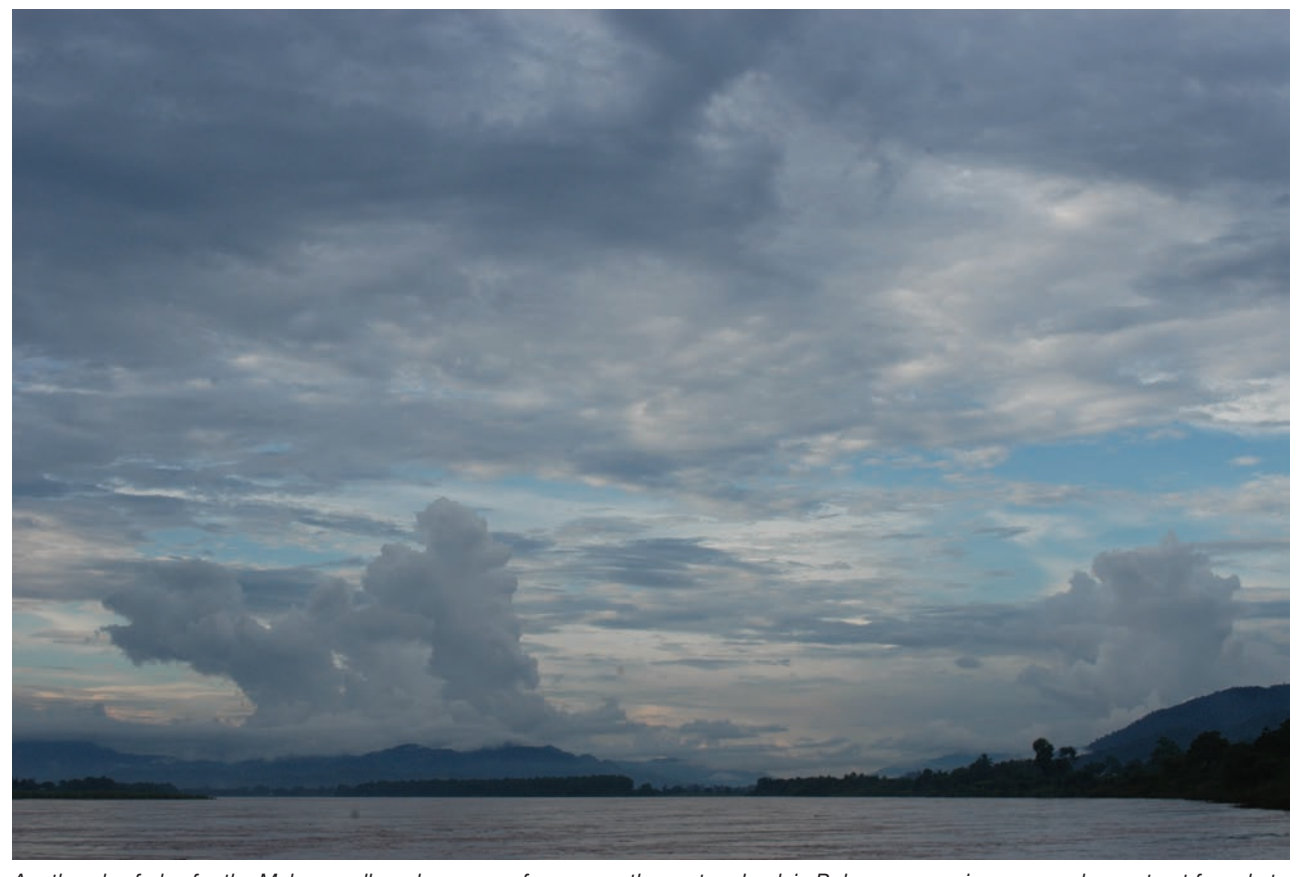
Another day fades for the Mekong valley where some farmers on the eastern bank in Bokeo are growing corn under contract for sale to Thai traders on the western bank.

For companies like CP, national borders are far less important than market chains. Farmers are a link in those chains, and farmers in Laos are interchangeable with farmers in Thailand, China, Cambodia and Myanmar. CP decides where to source commodities based on a comparison of costs. And although Lao farmers do not think of themselves in these abstract terms, they are increasingly aware of the importance that prices play in their lives.