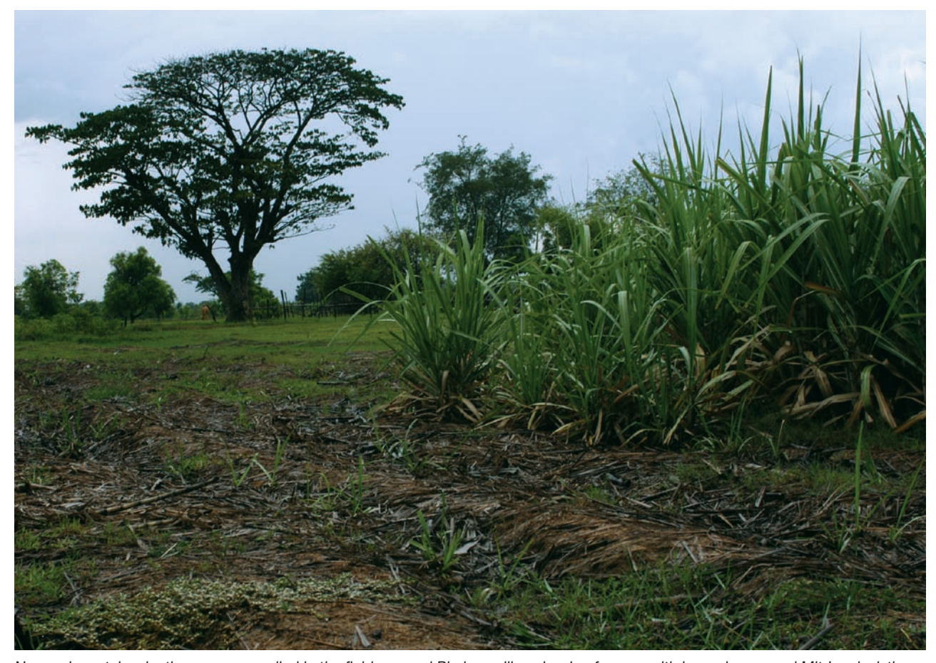
No one is certain why the sugar cane died in the fields around Phaleng village leaving farmers with heavy losses and MitrLao insisting on full repayment of inputs

Beneath exhausted grey clouds breaking up to let late afternoon sun shine through, Udon Nantawong stands surveying his fields studded with olive green trees and the gently sloping down to a small stream and a brackish pool. This halcyon picture is smudged when Udon turns his eyes down to the matted, decaying stems lying brown and forlorn across the furrows.