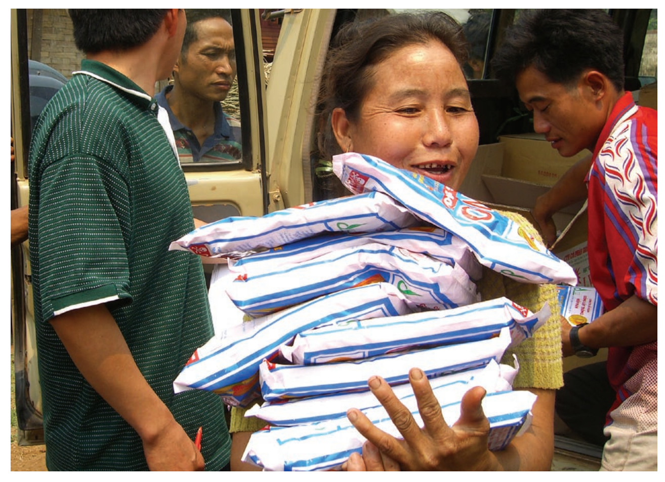
A Khamu villager in Nam Ha collects seeds from FUF to grow corn under contract for the first time

With the knowledge and income that has come with contracts, some villages have broken away from FUF, financing the inputs themselves. Some villages are able to roll with the ups and downs of the market, while others have struggled and returned to FUF.