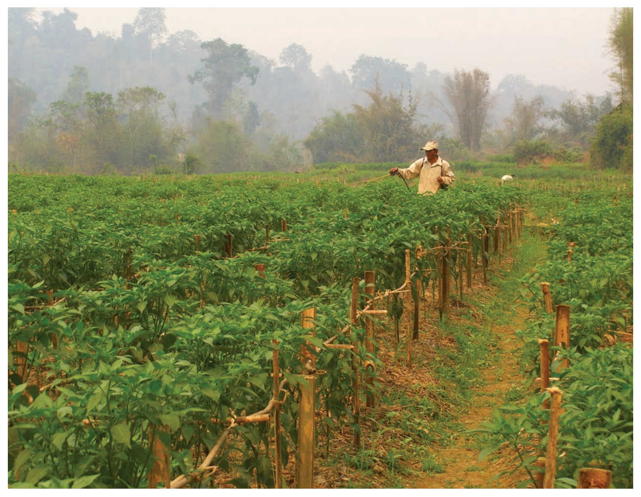
Farmers say they were not given protective clothing to wear when applying chemicals to chilli bushes under contract with Phet Houng Heuang in Muang Kham, Bokeo in April 2007

For some farmers in Bokeo the 2007 dry season was unusual. Instead of visiting friends and relatives, repairing the house or building fences they were farming under contracts for the first time.